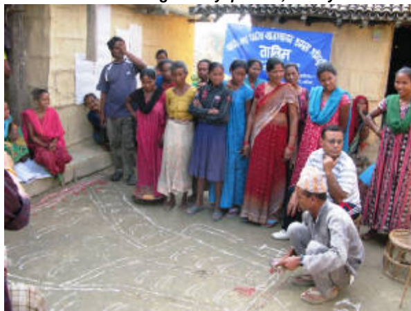
PVA during EPP Training at Suryapatuwa, Bardiya

from NDRC and ActionAid Safety Net Activists. Use of PVA and development of Contengency Plan for the respective DMCs are the out come of the Training. The Participants are now confident initiating DP works and claiming rights for their protection and security.