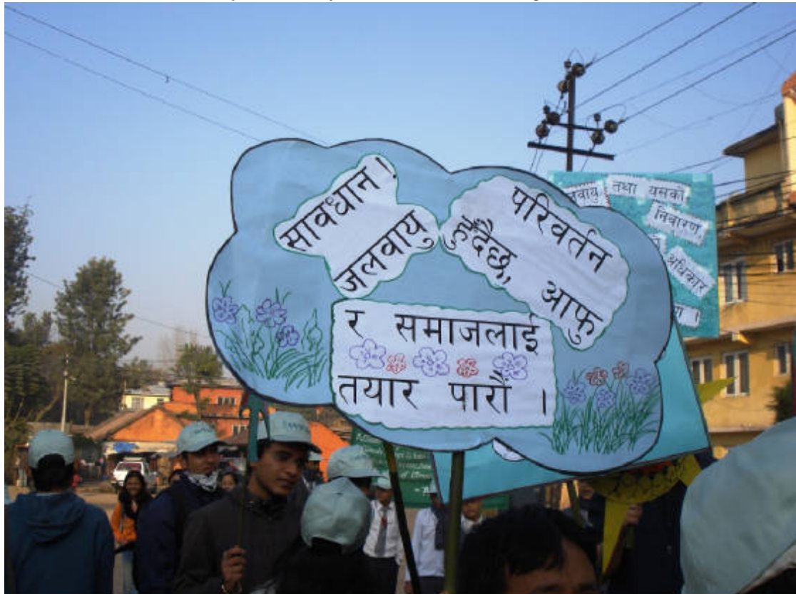
Slogan chanted Climate Pared 6th December 2008

Koshi flooded the Nepali village in East Nepal