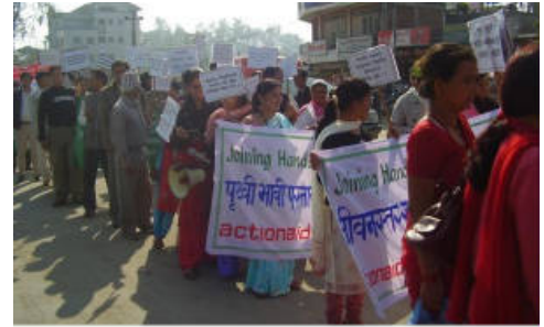
Nepal Global Day of Action on Climate Change 2008

A one day Climate Run and Climate Pared has been organized on the occasion of Global day of Action on Climate Change on December 6th 2008 in Capital Kathmandu and Chitwan. The program was held among the partner agencies like CCNN, AINCCTF, ECO, WWF, youth groups in Kathmandu as well Ecological Service Center, Practical Action Nepal, Youth Society Nepal, Rampur Agriculture Campus, Seed Tree Nepal, Environmental and social Organization Nepal, Baghesowri Community Forest, Lions Club of Bagheswori, Disaster Management Group Kabilas, Prabhat Kiran Sewa Samaj, Organic Agriculture Groups from the district level stakeholders.