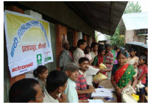
Rapid Response through PNGO FAYA Kailali

AAN is immediately responding to flood affected with RTE Food and Trampoline to most affected area at Chandani and Dodhara VDC through it EDM PNGO OCCED Nepal to cover about 500 HHs.