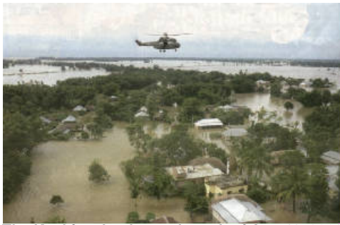
The Koshi embankment breach of Aug 18, 2008 created a Disaster to East Nepal, displaced over 50K HHs

the villages and with the initiatives of the local administration, 40 doors out of 56 was opened to provide outlet to the water. The locals began to flee from the immediate areas before and after 2 p.m. on 18th August as the water started to swamp the villages. The floods damaged two spurs, no. 1209 and 1210, endangering a dozen VDCs as the flood caused the embankment to crumble.